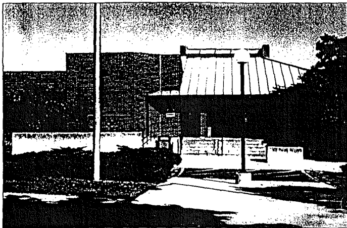
Schaumburg Township Public Library